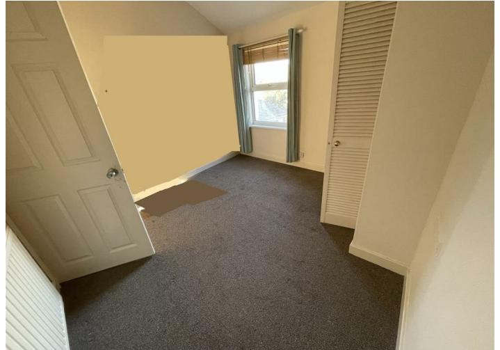
Ground Floor Approx. 34.7 sq. metres (373.7 sq. feet)